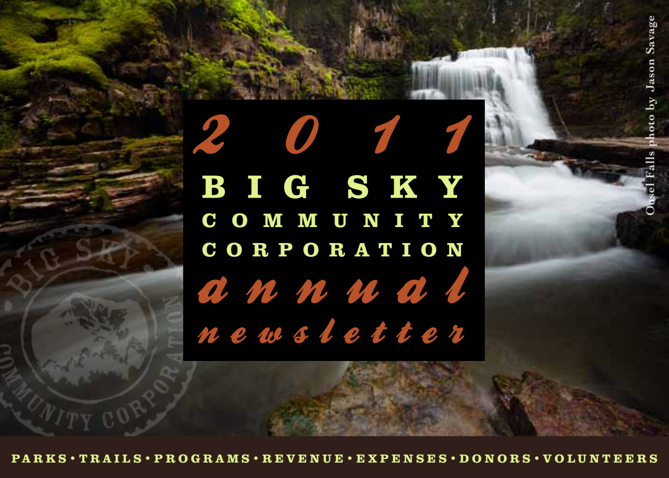
Ousel Falls